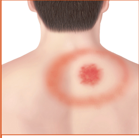
Bull's eye rash on the back.